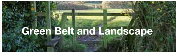
Green Belt and Landscape

National and local Green Belt policies will be applied beyond the built-up area of KDBH. In the limited circumstances where development may be permissible, the openness of the Green Belt will be safeguarded by the withdrawal of permitted development rights.