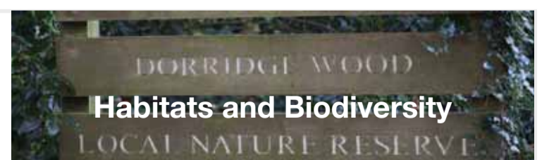
Habitats and Biodiversity

On sites where there are key local habitats and biodiversity, developments shall promote the preservation and restoration of such features as part of the scheme. Developments which fail to do so will be resisted.