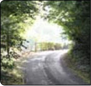
Photograph 3.2: There is a network of narrow, winding rural lanes often well enclosed by tall hedgerows and mature trees, such as at Mill Pool Lane.