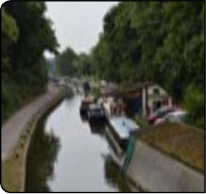
Photograph 3.3: Knowle Hall Wharf, part of the Grand Union Canal which contains the area to the east. The towpath is part of a long distance trail.