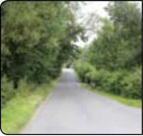
Photograph 3.1: Tree cover is present in hedgerows and pockets of woodland, particularly in the south of the area.